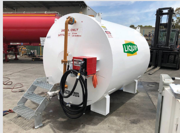
Liquip Farm Tank and fuel dispensing system